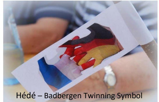
Hédé – Badbergen Twinning Symbol